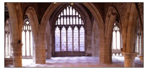
York St Marys