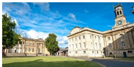
York Castle Museum

There are lots of great things happening in the next few months to look forward to, including our Fossils Roadshow in June and the opening of a new exhibition at York Castle Museum, which is based around the Battle of Waterloo. Summer is also fast approaching, and we will be busy organising more coffee mornings and catch up sessions for the coming months.